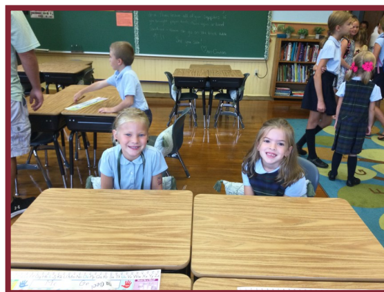
St. Leo School receives new desks and chairs.

This past year, Elk County Catholic School System made a host of improvements to our schools. These were funded through our generous supporters, grants, and strategic investment of our Covid-relief dollars.