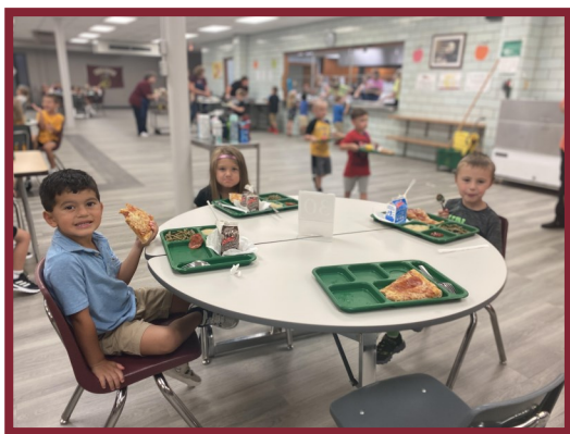
Preschoolers at SMCES enjoying new round tables in the cafeteria.